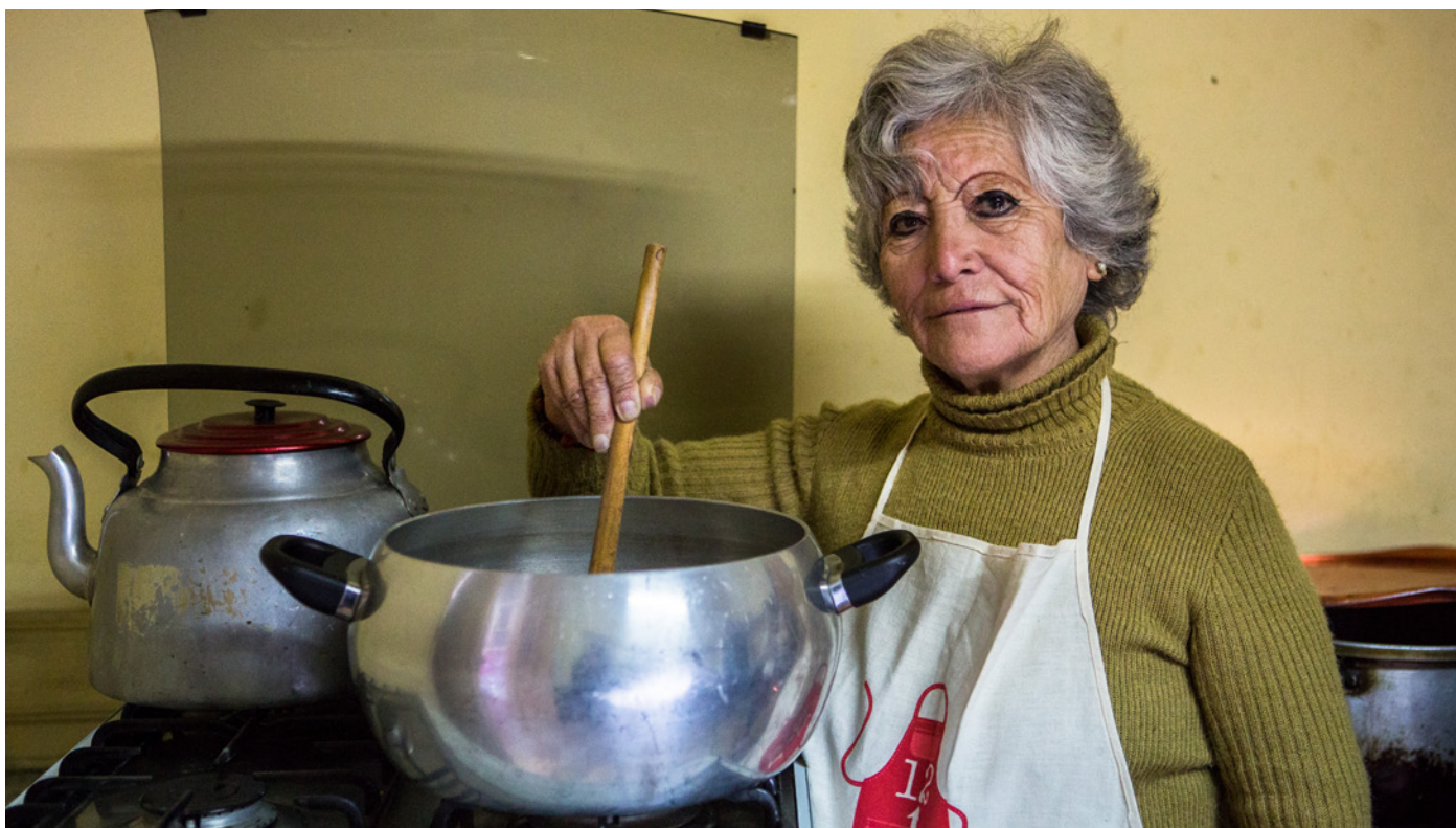
Workplaces, such as private homes, leave women susceptible to violence due to isolation and a lack of access to complaint and legal recourse mechanisms.

to public spaces and the use of public natural resources. Private homes in which home-based workers and domestic workers operate are considered high-risk workplaces due to the isolation of these workers (ILO 2016: para 14).