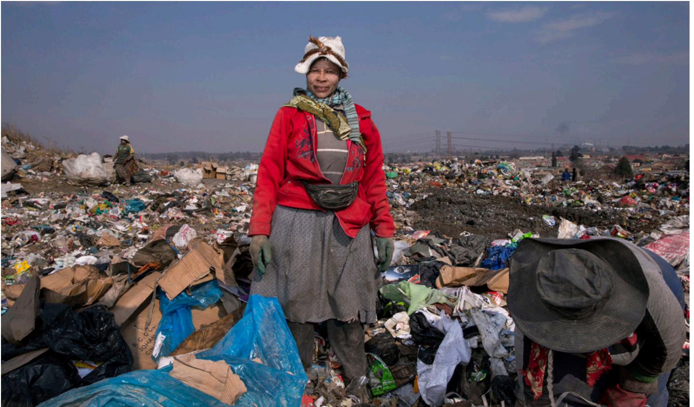
All informal workers are likely to experience violence due to their status in employment and lack of protection. Women informal workers are more vulnerable to gender-based violence due to the intersection of their gender and insecure working conditions.