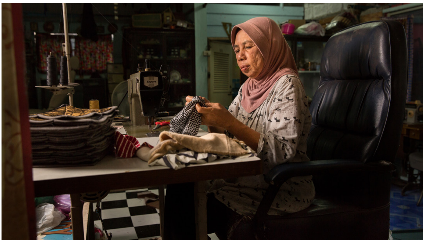
Home-based workers are vulnerable to contractors who may refuse to pay a decent rate, delay or withhold payments and subject women workers to psychological violence.

It requires a more integrated approach that draws on the resources of not only labour inspectorates, but numerous government entities at all levels, incorporating in particular the municipal authorities who control many informal places of work and owners of capital that influence how public space is used. It must also look beyond labour law to incorporate other areas of law that can more easily provide legal protections to informal workers (for example administrative law and municipal by-laws).